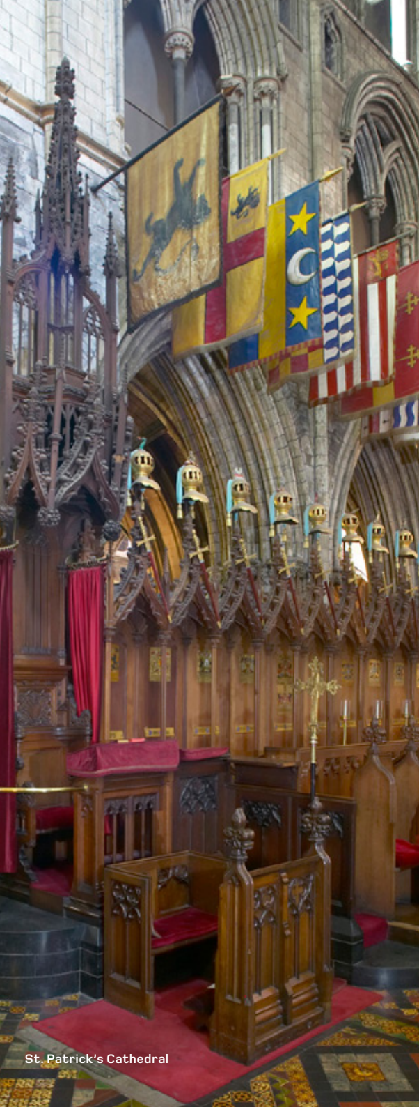
St. Patrick's Cathedral

An insider's guide to Dublin the way the locals live it