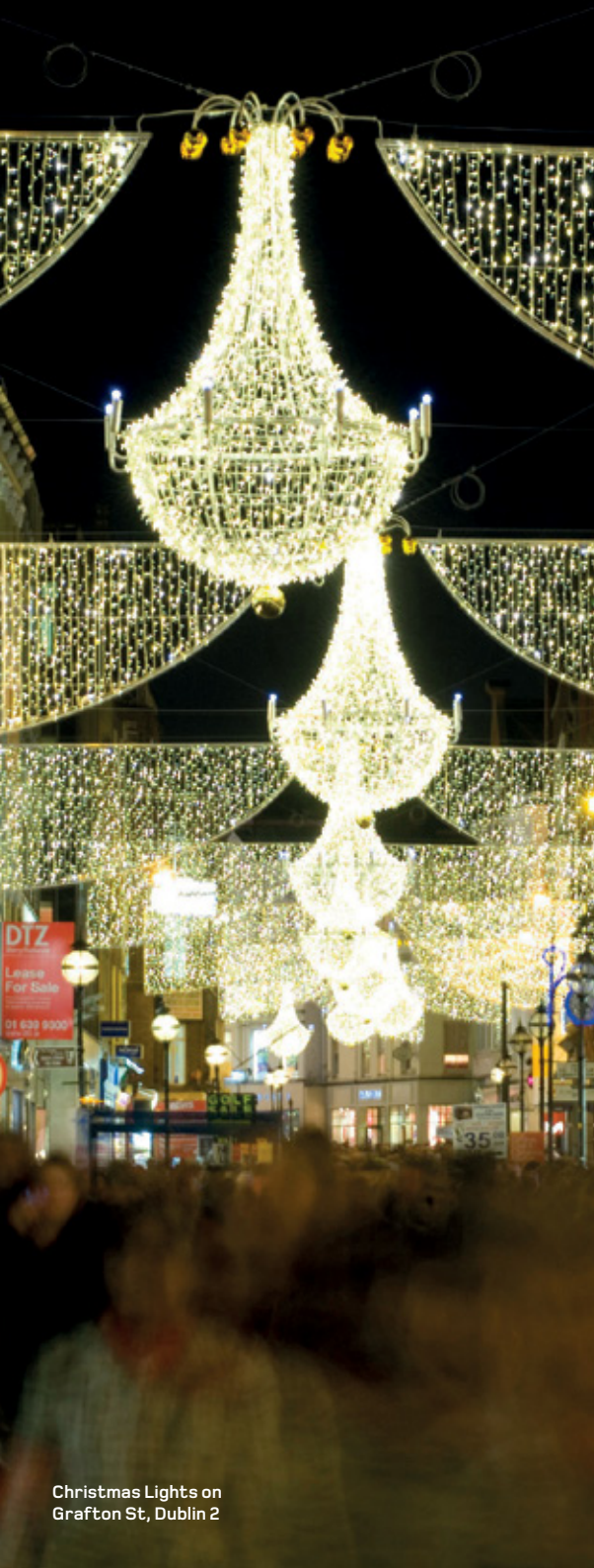
Christmas Lights on Grafton St, Dublin 2

An insider's guide to Dublin the way the locals live it