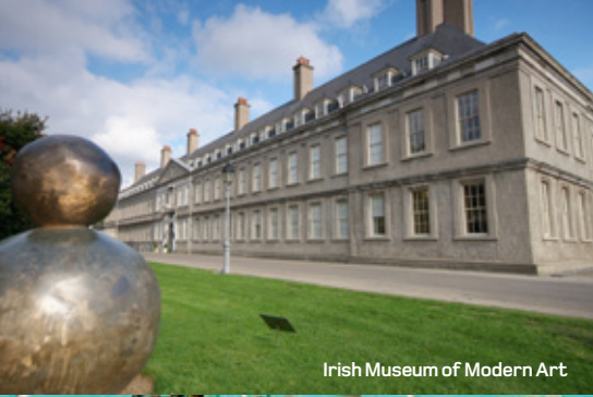
Irish Museum of Modern Art