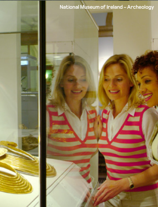
National Museum of Ireland - Archeology