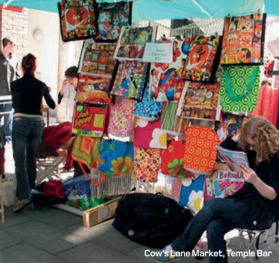
Cow's Lane Market, Temple Bar